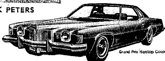
Grand Prix Hardtop Coupe

So give us a visit soon. We'll be happy to give you a guided tour. And while you're here, see what we can do for you on a '73 Pontiac. We're prepared to give you the best deal on one of the best cars you'll ever own—a '73 Pontiac. And courteous, dependable service on that Pontiac. You'll see it's true. We're not the same old place anymore. We're better. Which makes us better able to serve you.