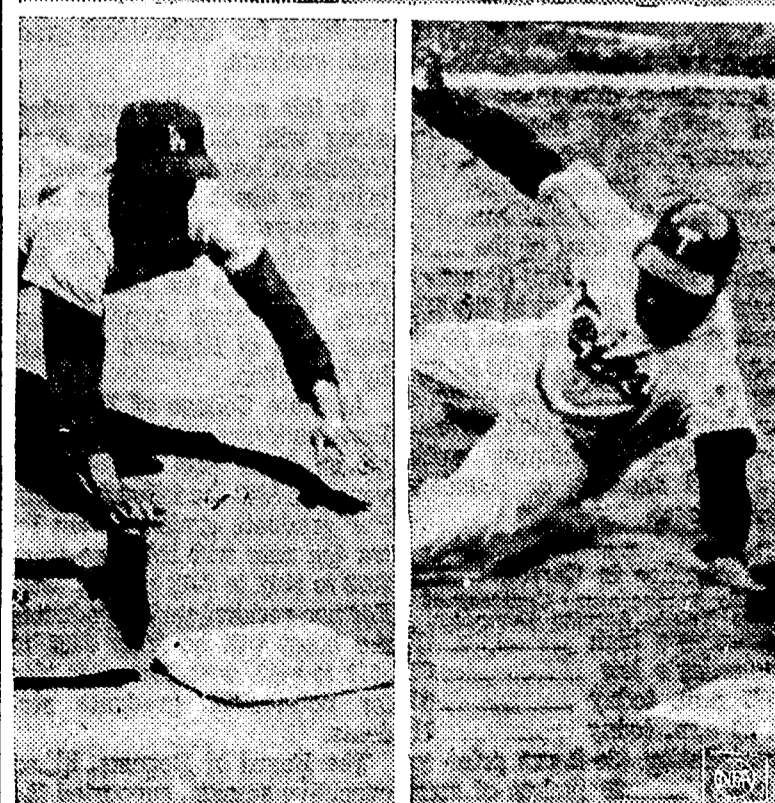
Doing The Crawl . . . No, it's not a new dance step. It's just what happens when runners like Doc Edwards of the Yankees (top), Maury Wills of the Dodgers, bottom left, and Sandy Valdespino of the Twins get caught short of their destination.