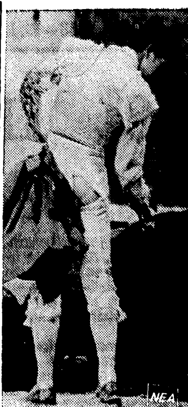
Air-Conditioned . . . trousers were not part of the plan, but prove how close the bull came before Palomo Linares made the kill at Aranjuez, Spain.