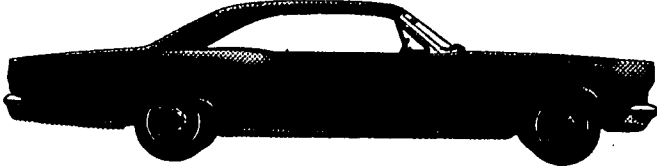
Fairlans: "spinner-type" wheel covers!